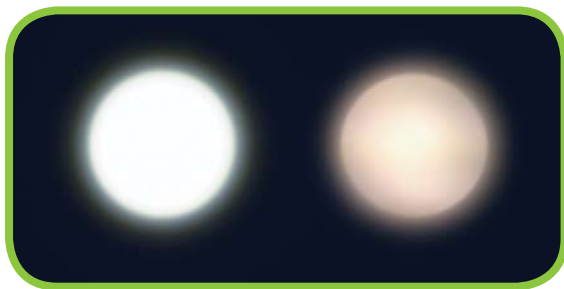
LED VS. HALOGEN