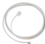
703415 Pressure Tubing