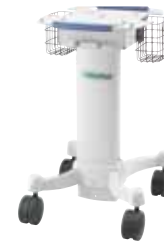
401393 Office Cart