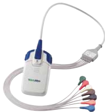
HR-100 Shown with 7-Lead Patient Cable (704547)