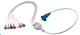
704547 7-Lead Patient Cable