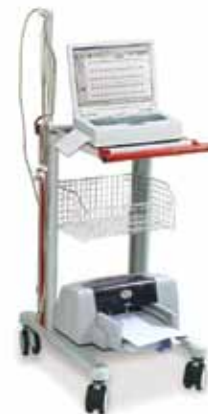
102789 CP300 Cart, with Shelf & Basket