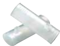
703418 Disposable Flow Transducers

SPIRO-NS-RS232 SpiroPerfect Module, CPWS, w/o 3-liter calibration syringe. Includes: CPWS spiro Software module, sensor, pressure tubing, 8 flow transducers, electronic manual, 2 training posters, and quick reference card