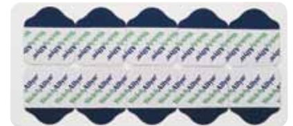
45008-0000 Resting Tab Electrodes, Box of 1,000