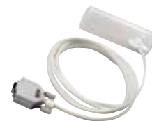
100400 Spirometry Upgrade for CP 200™