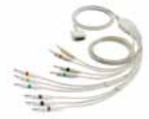
102787 10-lead patient cable, AHA, CP300™, banana plugs, 2m