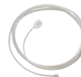
703415 Pressure Tubing