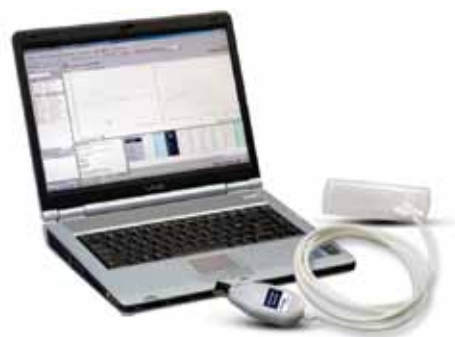
SPIRO-S SpiroPerfect® Module (Laptop not included)