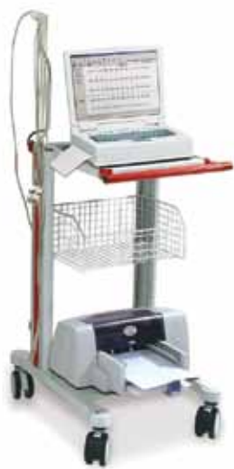
CP 300™ Cart with Shelf & Basket

CP3-1E1 CP 300 AHA, D, Eng, US PC - Noninterpretive 12 lead multichannel Cardio Laptop ECG. 15" color preview screen, alphanumeric keyboard and AHA patient cable