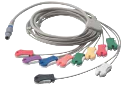
SE-PC-AHA-CLIP 10-Lead Stress Patient Cable