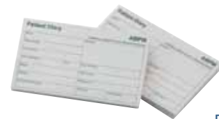
5100-42E Patient Diaries