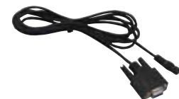
6100-24 ABPM 6100 PC Interface Cable