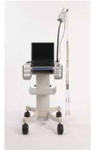
401393 Office-Based ECG Cart