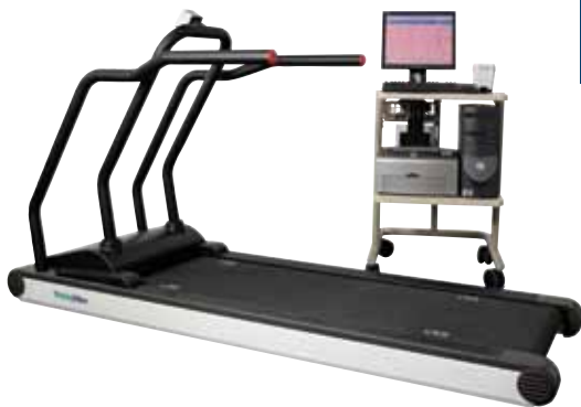
PC-Based Exercise Stress System