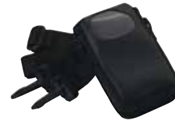
6100-21 ABPM Custom Pouch