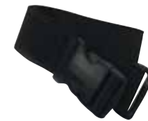
6100-22 ABPM 6100 Shoulder Strap