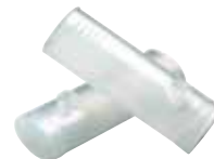
703418 Disposable Flow Transducers (25/pk)