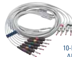
401129 10-lead Replaceable Lead Set, AHA, Banana clip, four limb leads and six precordial (for use with 400293)