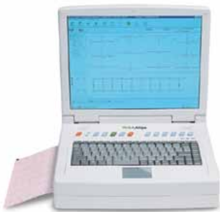
CP3-1E1 Noninterpretive 12-lead Multichannel ECG